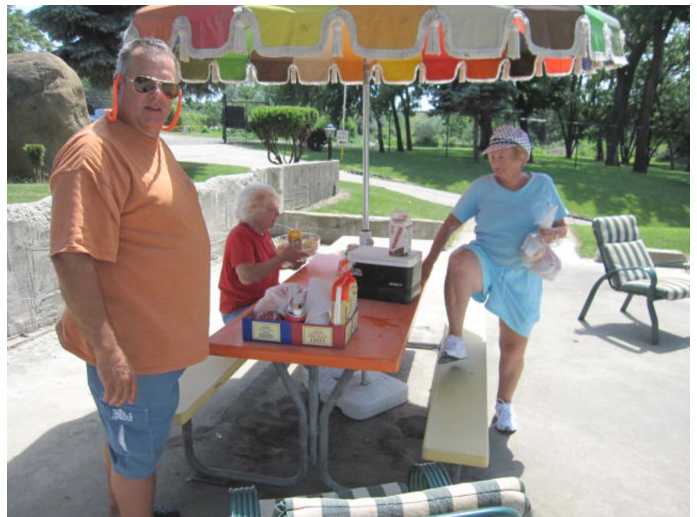
Figure 5. Boat gang at lunch stop along Cal Sag Channel