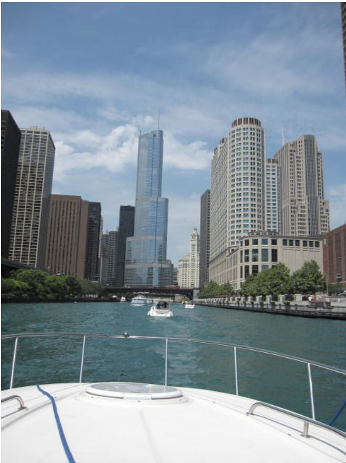
Figure 4. Going downstream on Chicago River through Loop