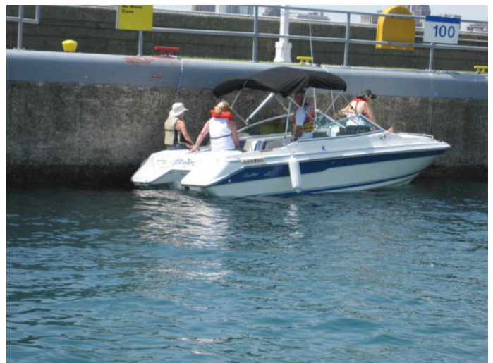
Figure 3. Little Bird in Chicago Lock